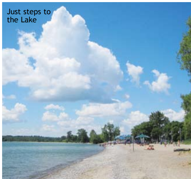
Just steps to the Lake