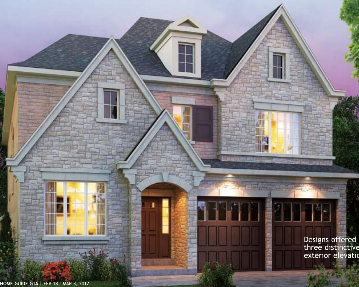
Designs offered in three distinctive exterior elevations

appreciate. “When I am in the kitchen and we have guests in the family room, I'll still be a part of the conversation,” Patricia says of the openness to the Great Room. Most of the designs have eliminated a formal living room and put all of this space into providing a large open Great Room/kitchen configuration that still allows for an elegant dining room. In many plans, a main floor library/home office is also accommodated. “I've always thought the living room was such a waste of space,” says Patricia who will be moving