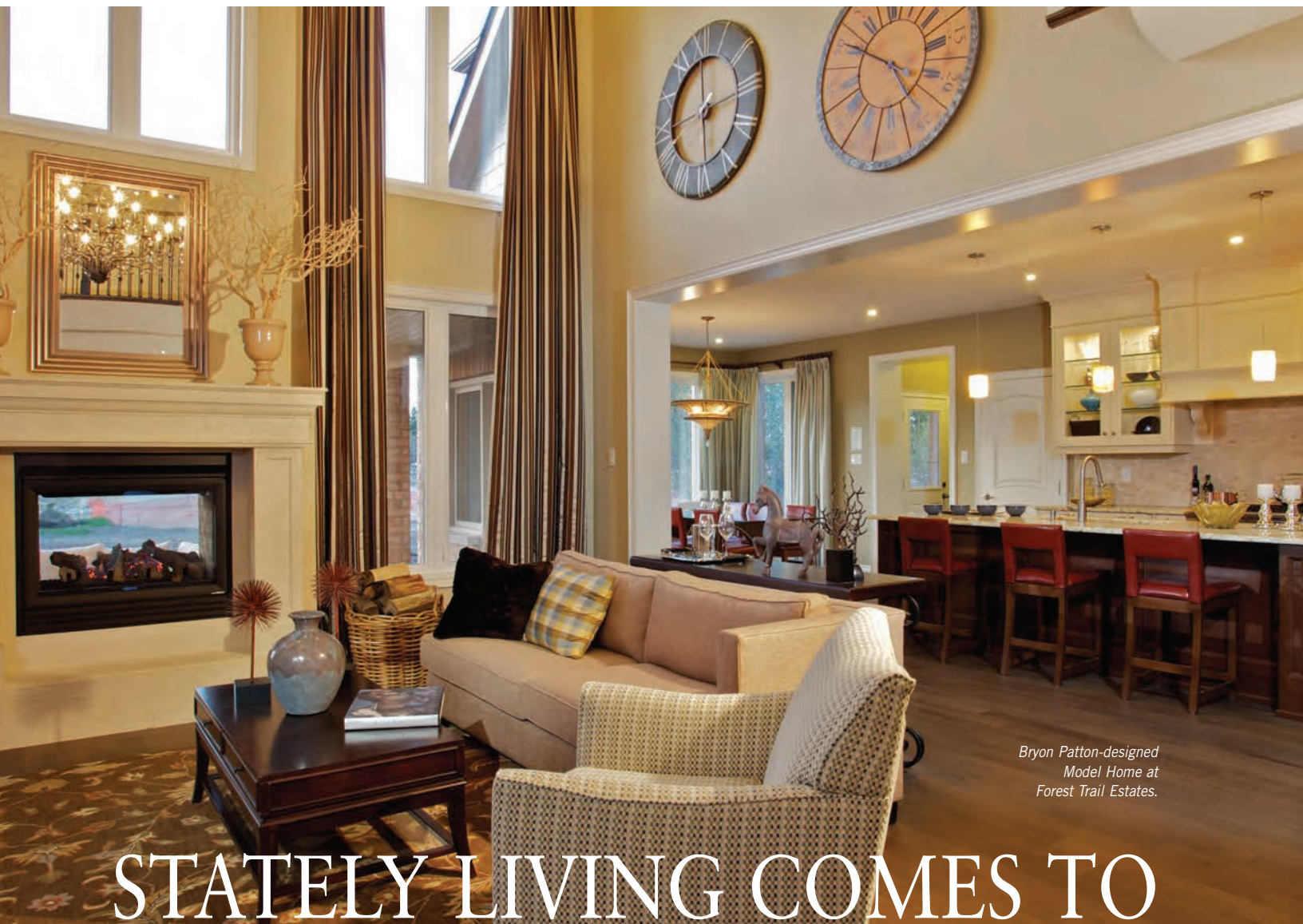
Bryon Patton-designed Model Home at Forest Trail Estates.