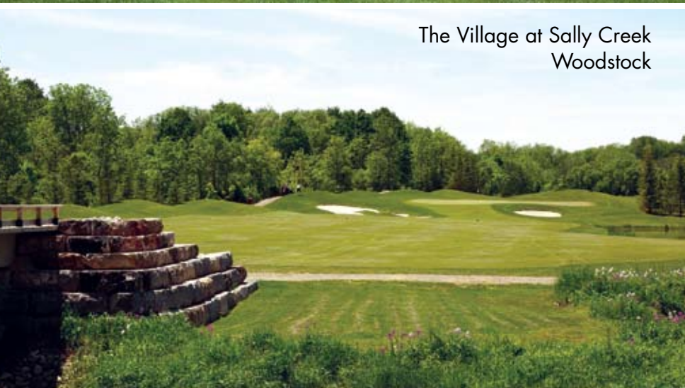
The Village at Sally Creek Woodstock