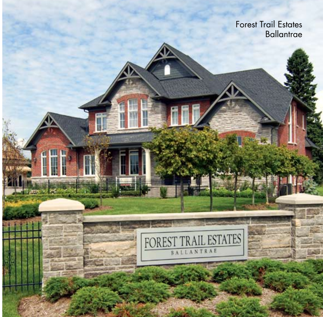
Forest Trail Estates Ballantrae

Uptownes - Geranium's loft-inspired urban towns aimed at first time buyers is coming soon to Stouffville. In 2014, Pace on Main, a mid-rise luxury condominium situated on Main Street, is planned to be released for sale.