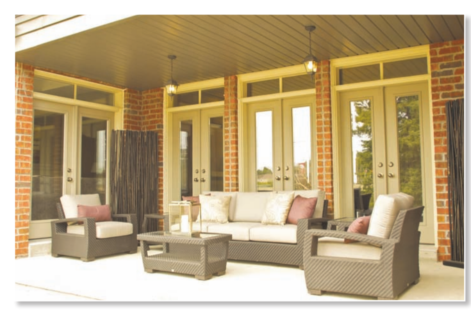
Builders are taking a fresh approach to the rear of a home.

epending upon where and how you live, buyers have helped to create a demand for different housing types as well as a desire for more variety in designs of smaller homes. This demand has spurred both creativity and innovation as builders and architects are challenged to improve the use of space and to make sure our industry is meeting buyers' needs with homes that work for today's families.