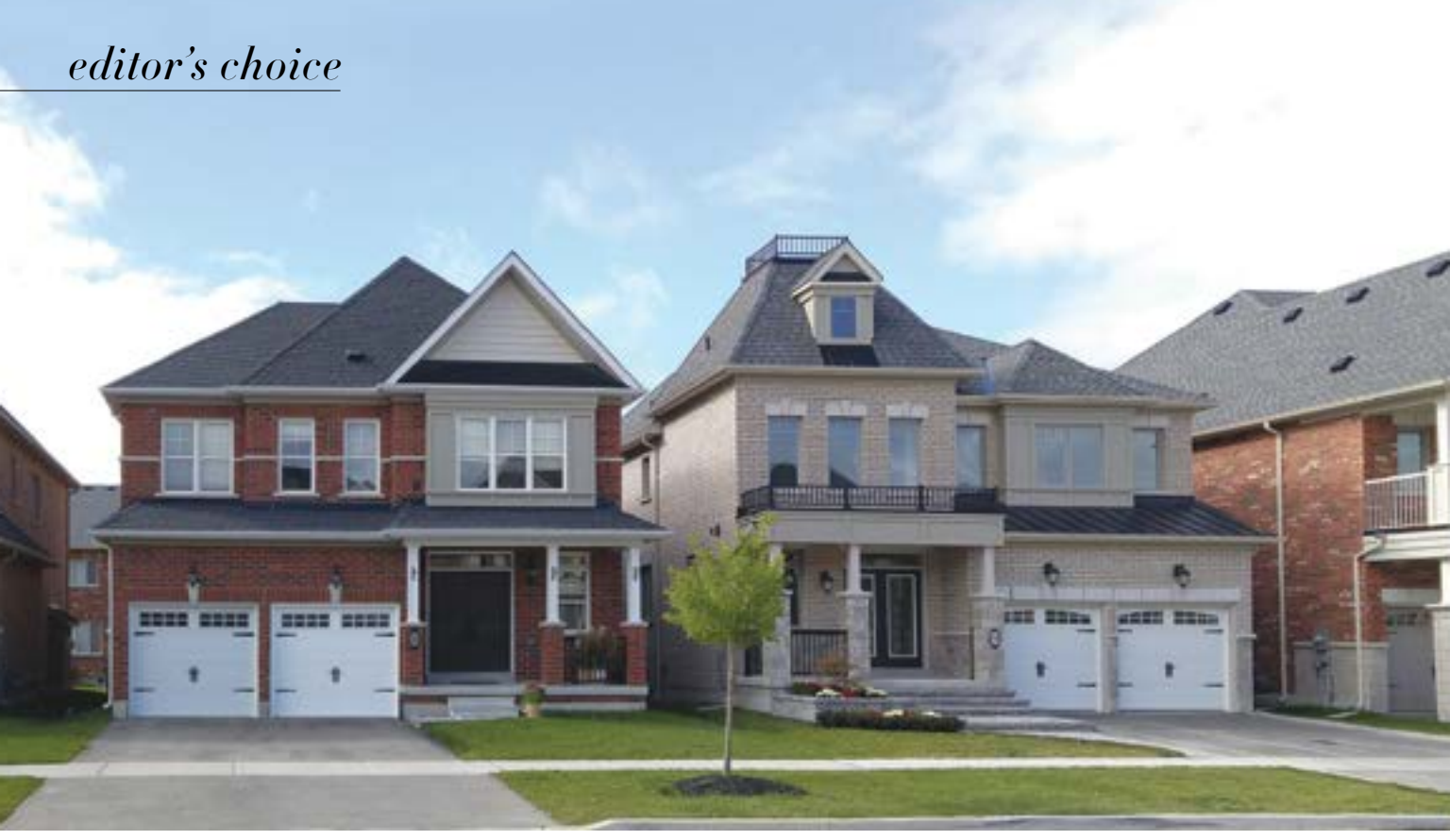
Homes at Trails will reflect Cardinal Point's highly desirable "Urban Heritage" exteriors.