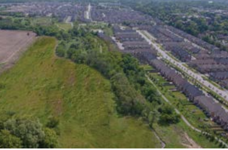
Homes at Trails will overlook the ravine.