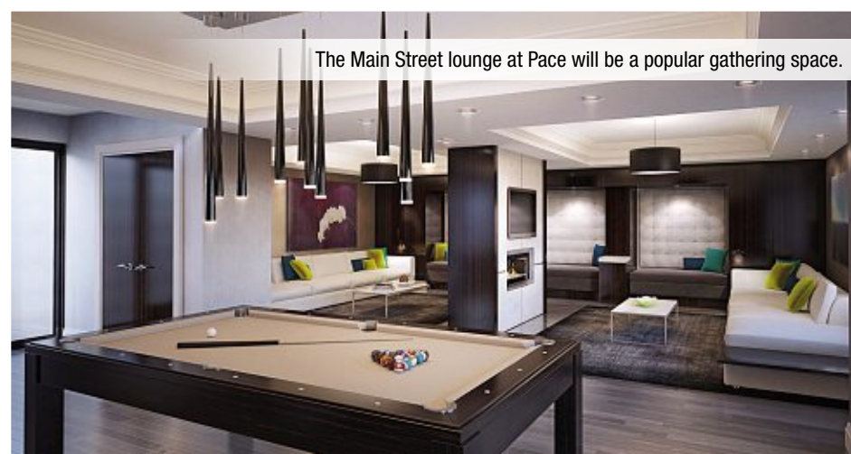
The Main Street lounge at Pace will be a popular gathering space.

Since 1977, Geranium has developed numerous master-planned communities, taking them from conception to completion, creating desirable neighbourhoods and establishing a solid reputation for quality design and construction. To learn more, visit geraniumhomes.com